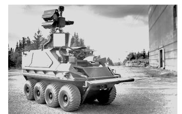
MOBILE DEPLOYMENTS Suitable for mobile and vehicle mounted applications