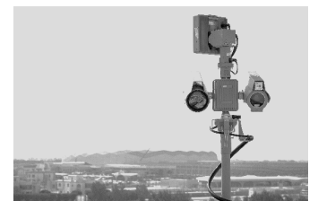
THROUGH SHAFT Enables fixed payloads to be mounted above the PT Director