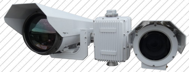
Above: Typical Jaegar Searcher. Models will vary.